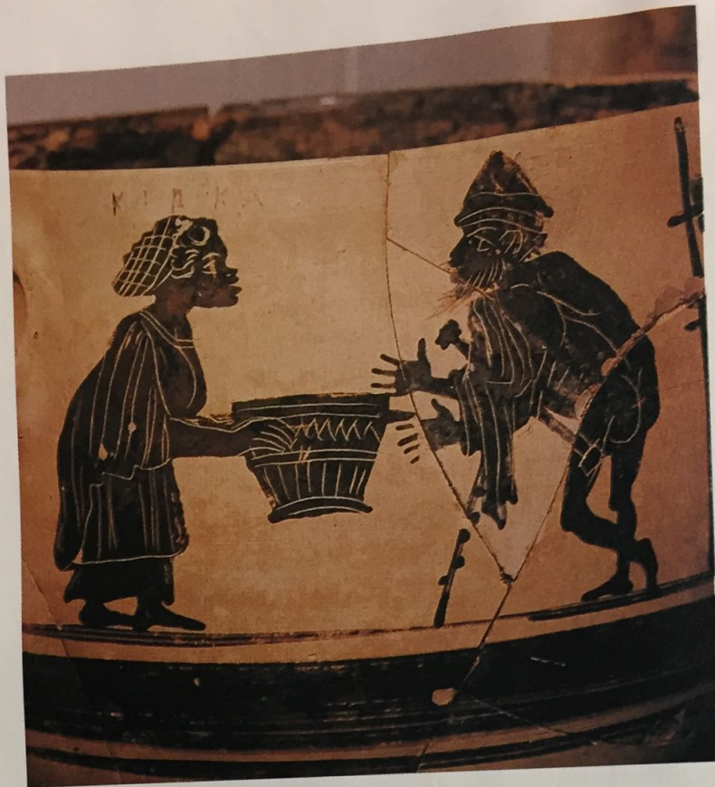
Circe offers the magic potion to Odysseus. Detail from Greek vase from Thebes. British Museum, London.