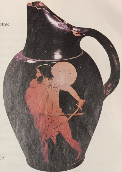
Odysseus pursuing Circe. Greek vase. Louvre, Paris, France.

She responds to their pleas with the command that Odysseus alone descend to the Land of the Dead, "the cold homes of Death and pale Persephone," queen of the underworld. There Odysseus must seek the wisdom of the blind prophet Teiresias.