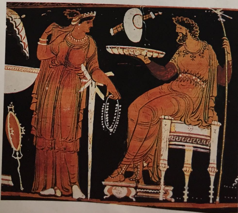
Persephone, queen of the underworld, with her husband, Hades (4th century B.C.). British Museum, London.