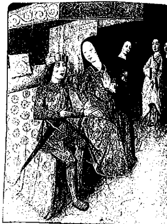
Man and woman, from a fifteenth-century manuscript of Virgil's Aeneid .

106. cossetted (käs'it·id) v.: pampered.