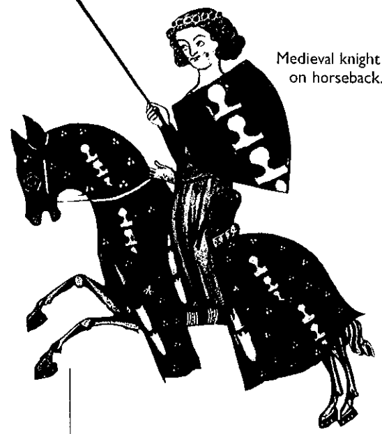
Medieval knight on horseback.

214. sovereignty (säv’rən·tē) n.: power.