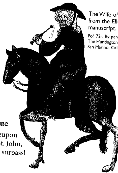
The Wife of Bath, from the Ellesmere manuscript.

Fol. 72r.