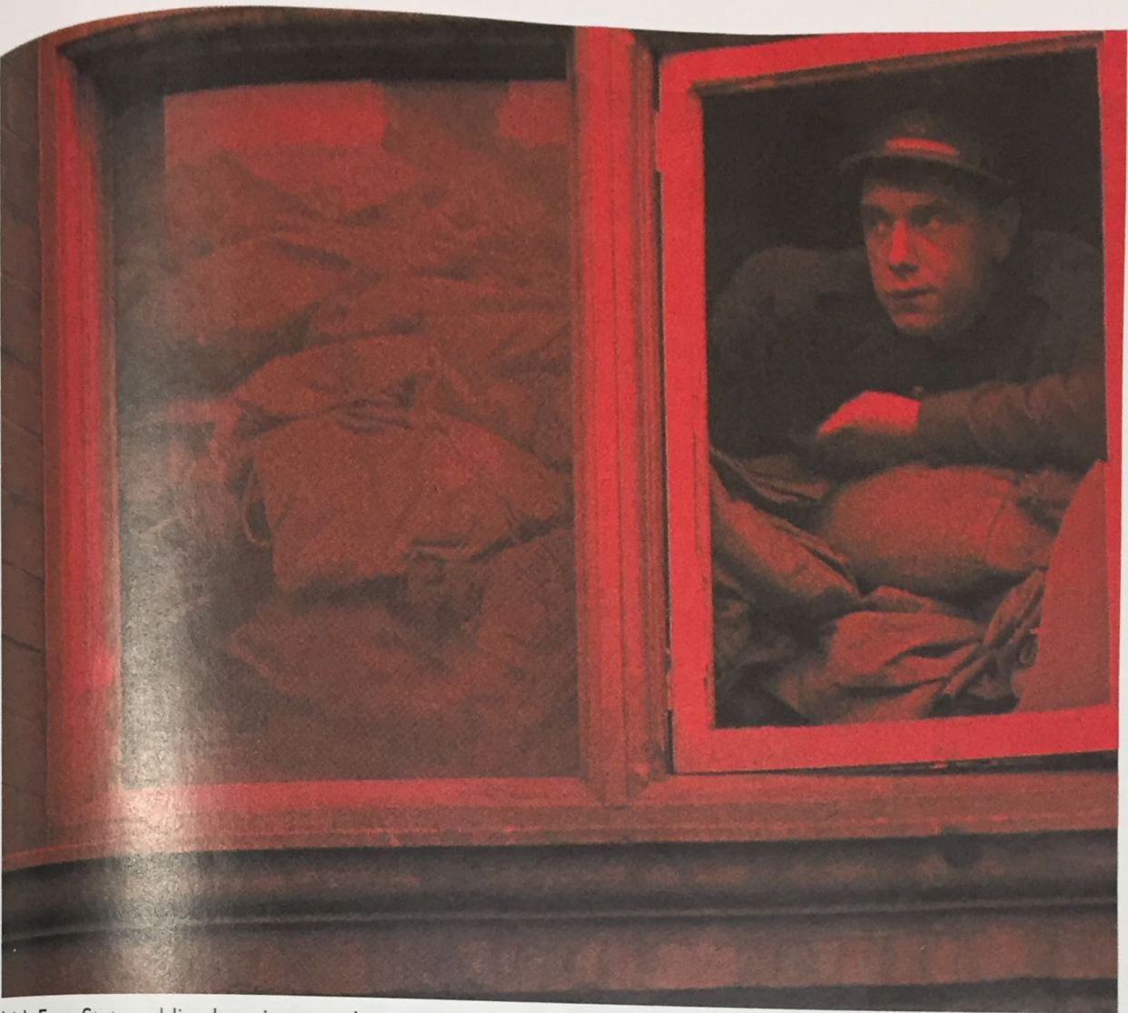
Irish Free State soldier keeping guard over a post office (September 1922).

at his feet. The revolver went off with the concussion and the bullet whizzed past the sniper's head. He was frightened back to his senses by the shock. His nerves steadied. The cloud of fear scattered from his mind and he laughed.