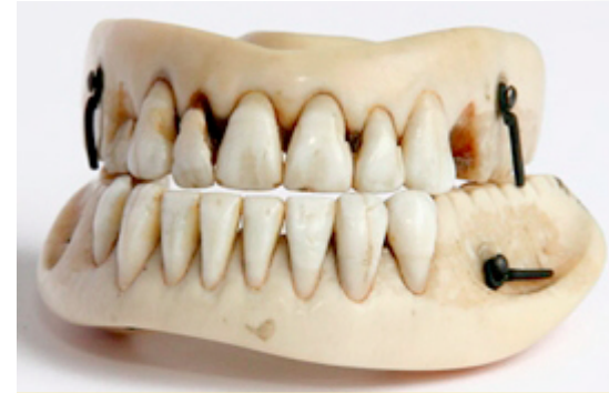
Figure 2: A set of dentures using Waterloo teeth from the British Dental Association Dental Museum. These still required metal hardware to function and fit correctly.